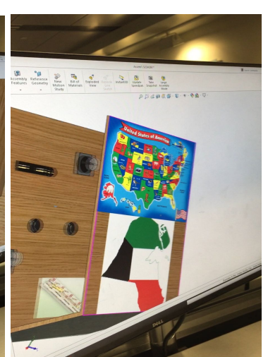
Figure 1: Solidworks assembly